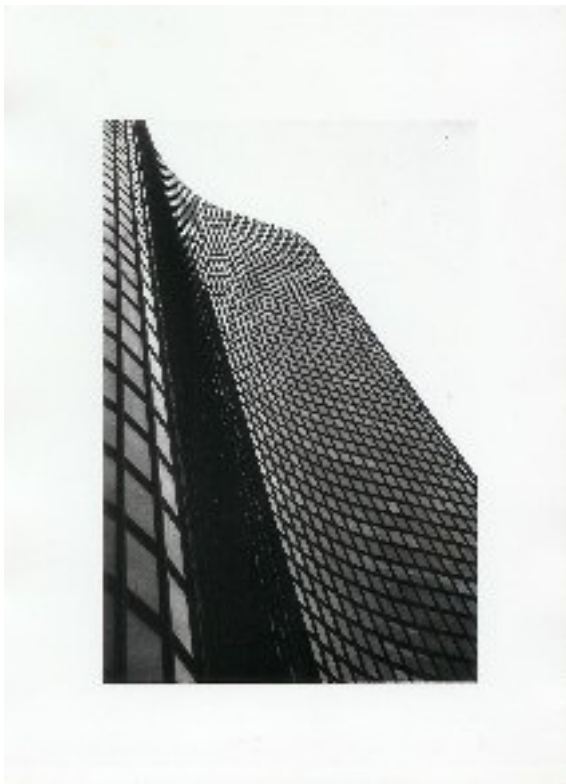
Trish VanderBeke , P.K. VanderBeke, Architect

Lake Point Tower is truly special In that few buildings ever achieve its timeless quality of design with its dynamic views to the city and lake.